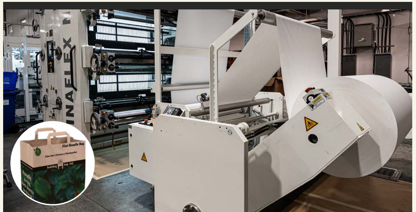
BULLDOG BAG'S NEW FLAT PAPER HANDLE BAG CONVERSION LINE IN ACTION.

For this new line Bulldog Bag offers in-line printing for up to 6 colors on both white and natural kraft paper with a variety of color options for handles, such as natural kraft, white or black.